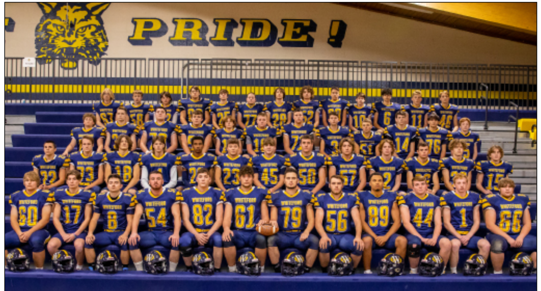
State Champions, 2022